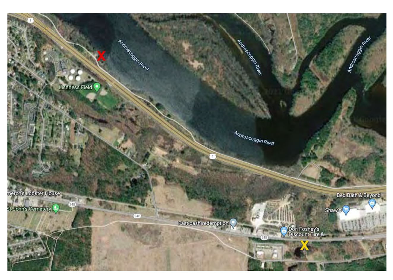
The red X shows the sewer outfall on the Androscoggin River. The yellow X is the site of the stream with dangerously high levels of the carcinogens.

The environmentalists also collected a sample from a stream between Bath Rd. and Allagash Drive, draining ponds on the former Brunswick Naval Air Station (BNAS) about 2,500 feet from where the stream empties into the Androscoggin. The site is about a mile southeast from the Brunswick Sewer District and just west of Cook's Corner.